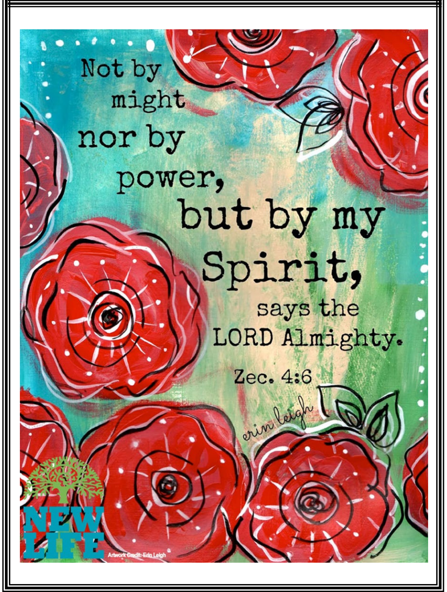
ST. JOHN'S EVANGELICAL CHURCH 211 EAST CARROL STREET KENTON. OH 43326